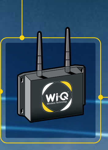
Portal Gateway Enables bidirectional communication between wireless readers and host computer