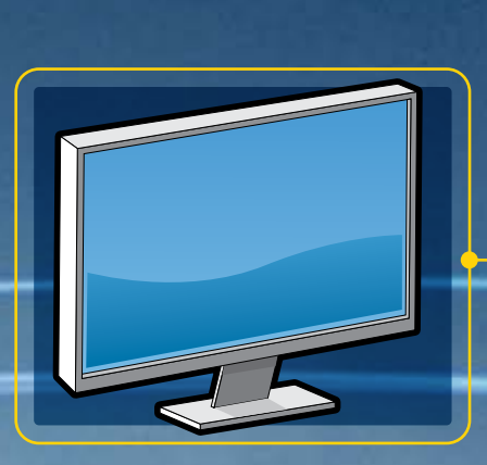
STANLEY Wi-Q<sup>™</sup> Access Control Software Allows management of access control application