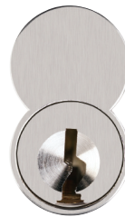
626 Satin Chrome