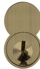
606 Satin Brass