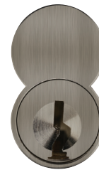
613 Oil-Rubbed Bronze