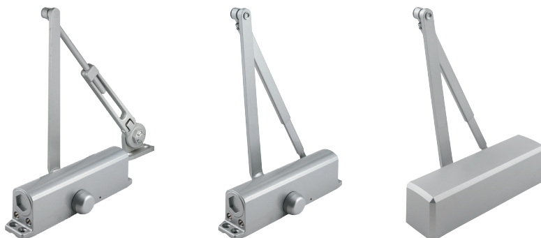
696: Painted Satin Brass